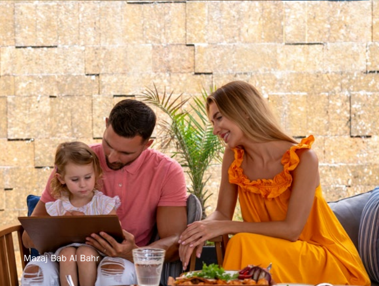
Mazaj Bab Al Bahr