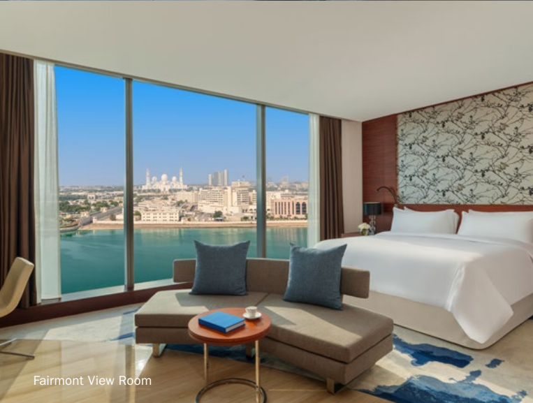
Fairmont View Room

Abu Dhabi surprises and delights at every turn, from its majestic dunes to lush mangroves, islands in the blue of the sea to islands of green in the desert. An exhilarating natural adventure awaits just around every corner. Immerse yourself in this captivating destination, where Fairmont Bab Al Bahr stands as a sparkling addition, offering superior hospitality, a breathtaking view over the Sheikh Zayed Grand Mosque, luxury service, and a convenient location as an urban resort in the heart of the city.