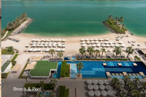
Beach & Pool